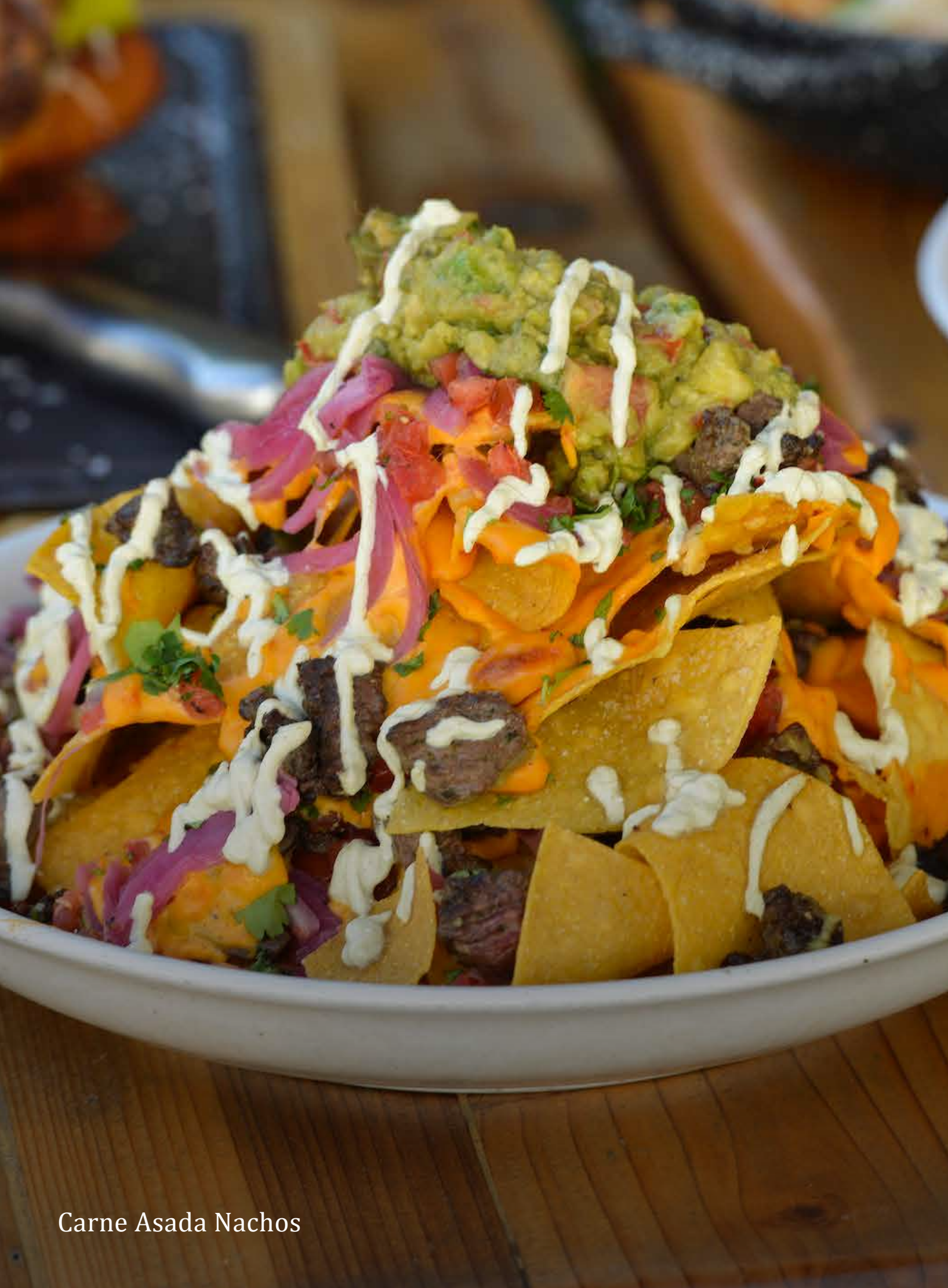
Carne Asada Nachos