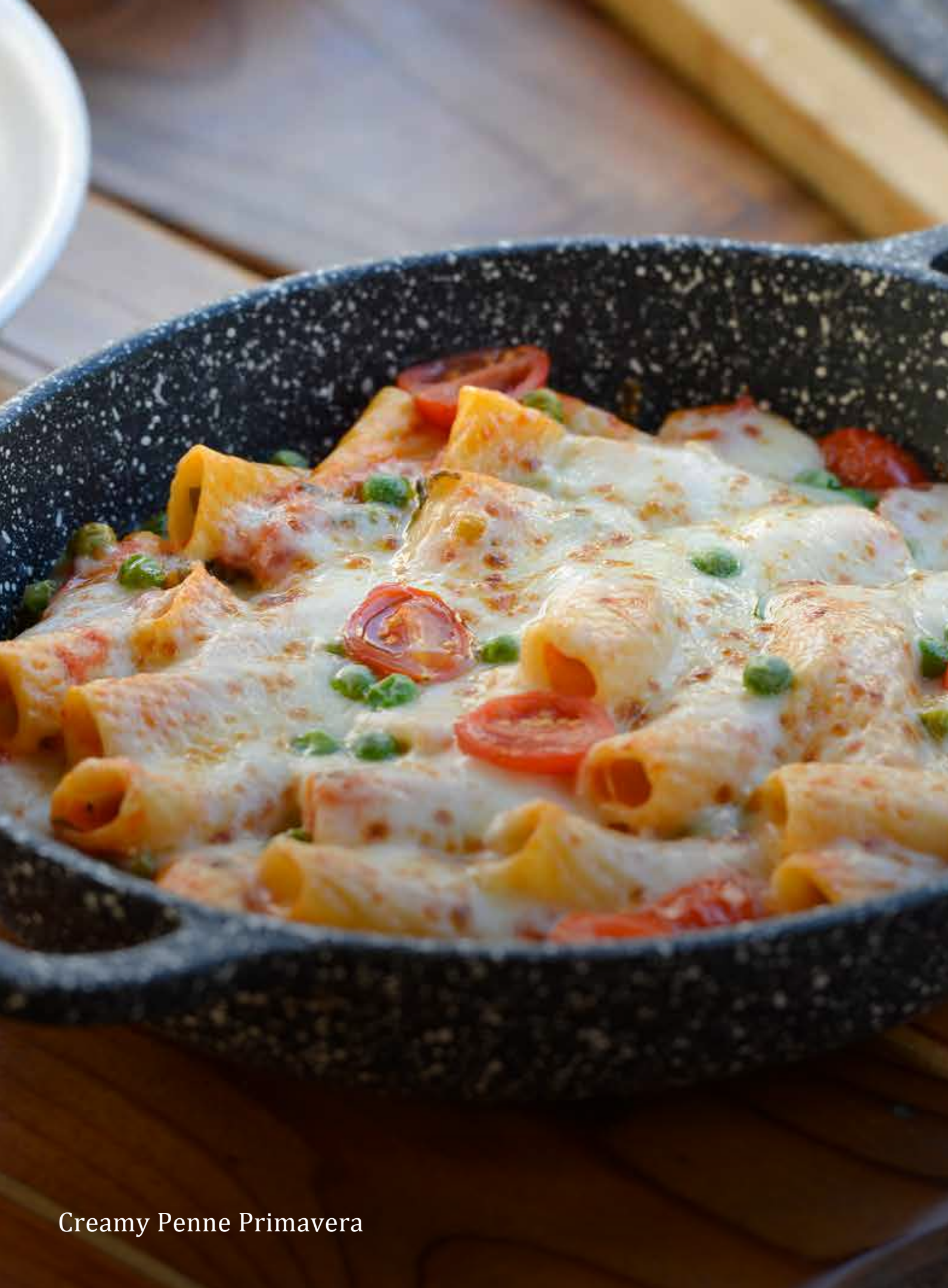
Creamy Penne Primavera